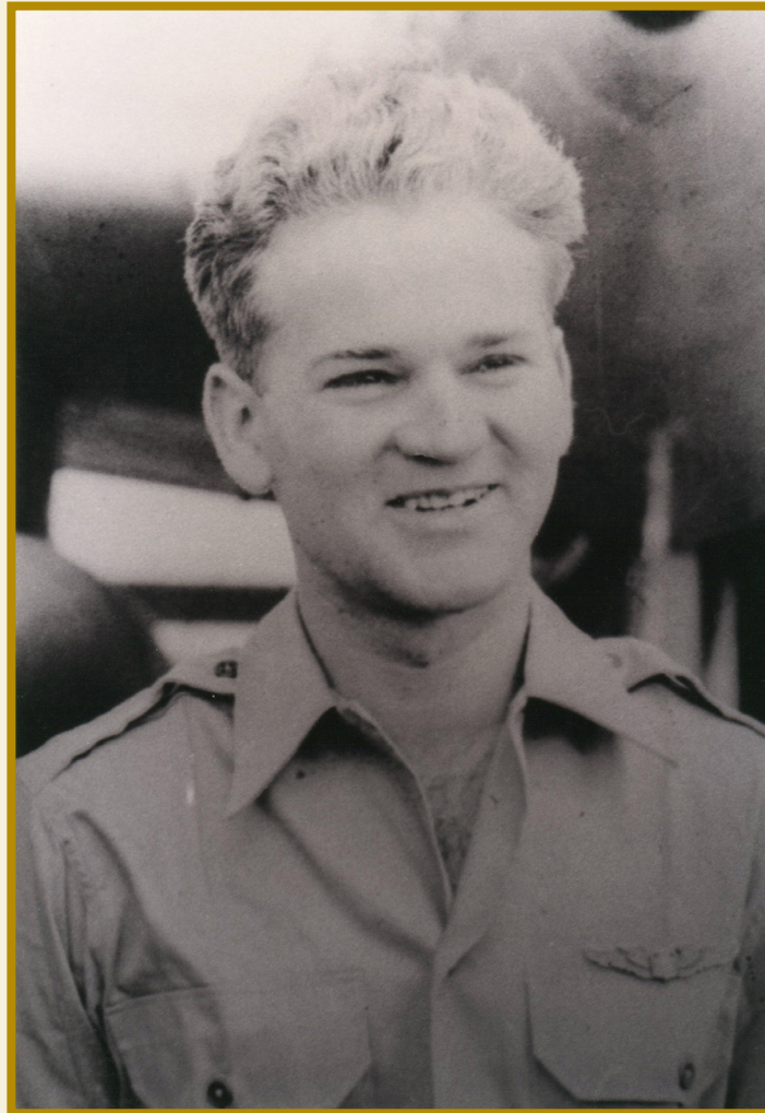
Jack Lenox: Fifteenth Air Force Lightning Ace